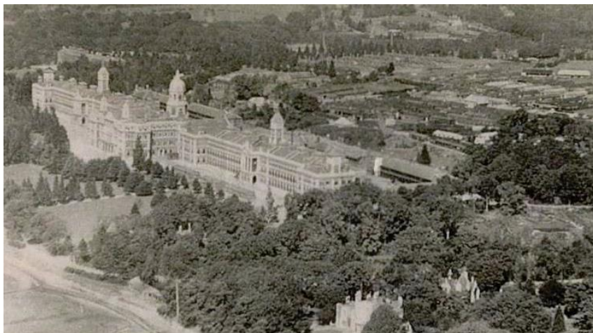
Royal Victoria Hospital, Netley